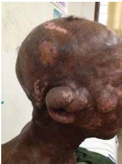
Patient diagnosed with Sézary syndrome